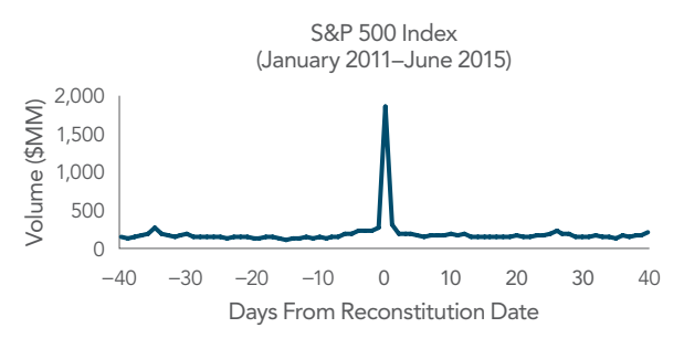
Exhibit 1: Equal-Weighted Average Trade Volume for Index Additions and Deletions